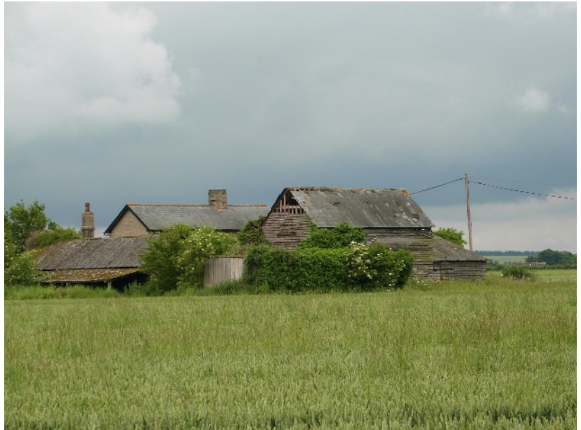
Mobb's Hole Farm

After a little less than a mile the farm track turns sharp right and the path continues diagonally left across the field towards Mobb's Hole. Turn right just before reaching Mobb's Hole and come out onto Northfield Road just south of Whitegate Bridge. Head west over the Cam for 250 yards then take the path to the left on the very fancy new concrete farm track servicing Eyeworth Lodge Farm's new poultry unit. After 600 yards the track turns right and runs straight up to Dunton. Just after the track levels out there is a track on the left giving access through the Dunton Community Garden to Church Street and the March Hare. Check opening times as it may not be open before 6pm.