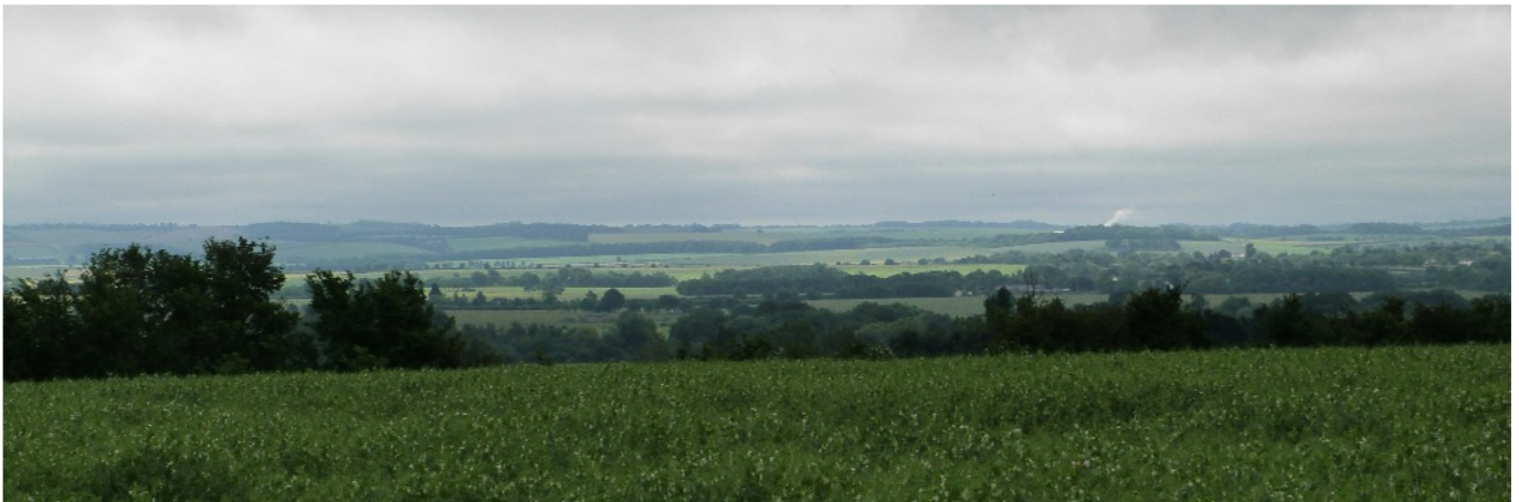
View to South-west from path above New England Farm

fence and a seven bar gate, but whatever it is for is never at home. Deer can often be seen grazing on the edge of the wood ('New Forest') below Top Farm. Turn right down the track to the Main Road.